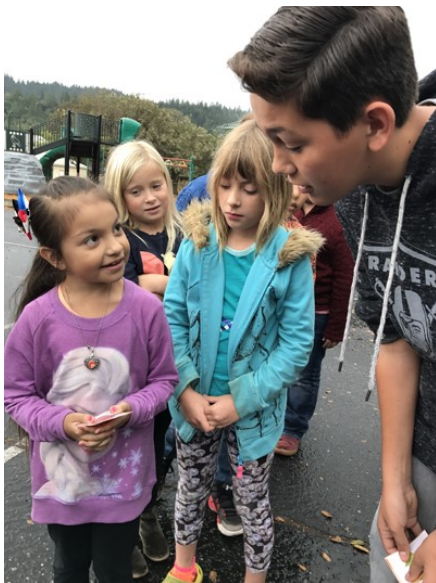
Older student explains recycling and composting to younger student at Anderson Valley Elementary School, Worm Wizards of Waste program.

The North Coast Resource Conservation & Development Council is a 501(c)3 non-profit organization with a mission to support sustainable agriculture and protection of natural resources in the north bay.